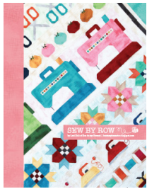
Sew By Row Quilt Booklet by Lori Holt of Bee in my Bonnet

Refer to pages 2, 3 & 4 of the Sew By Row Quilt Booklet for Block cutting and construction and page 23 for Row Sashing construction.